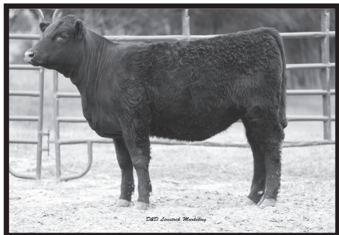
Fasr Blackbird 6009 - Lot 72