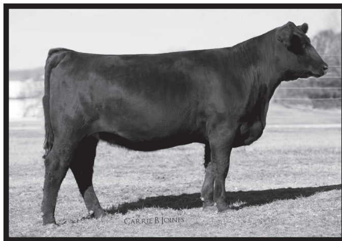
VPI Rita 2Z18 Rita 5C24 ET - Lot 57