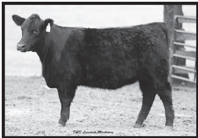
Fasr Blackbird 6012 - Lot 73