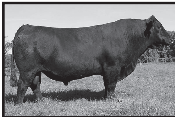
KCF Bennett Fortress - Sire of Lot 4A

• Selling the pick of the flush of heifer calves sired by Bennett Fortress. These heifers will be DNA tested prior to sale day.