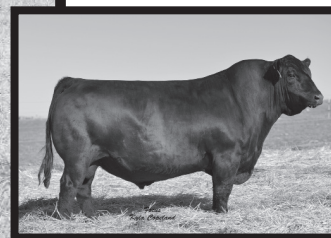
Basin Payweight 1682