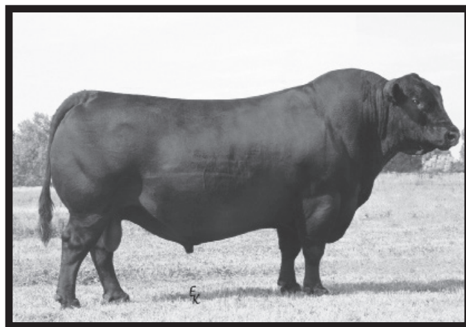
SAV Final Answer 0035 - Sire of Lot 36