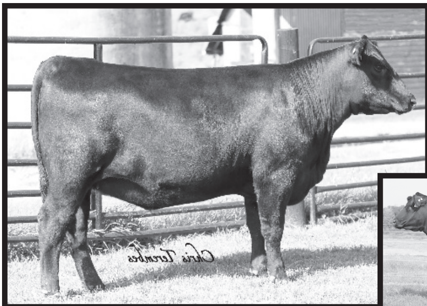
Wild Wind Black Cap 5K61 - Selling the right to flush this female