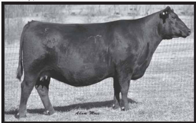
Thomas Lucy Rose 3938 - Lot 49

Sells nursing a heifer calf, Lot 47A (Reg. 18713786), born on 2/4/17 sired by GAR Surefire. Calf EPDs: CED +13, BW -0.1, WW +54, YW +101, Milk +40, Marb +0.75, RE +0.96, Fat +0.035, $W +76.03, $B +149.81