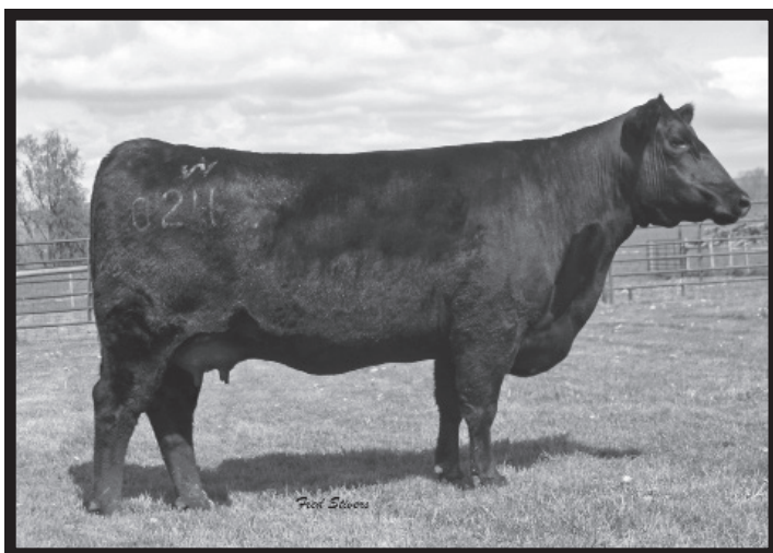
Rita 0242 of Rita 7068 5M2 - Maternal grandam of Lots 75A and 75B