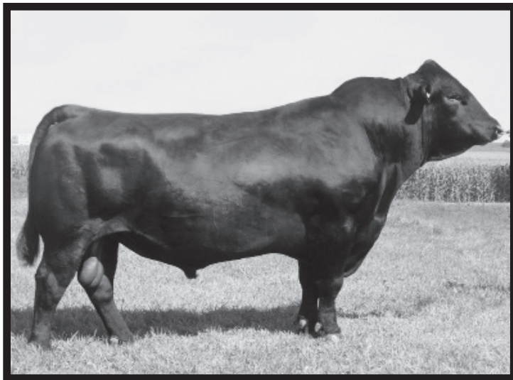
Connealy Impression - Sire of Lot 23