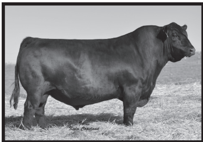
Basin Payweight 1682 - Service Sire of Lot 61