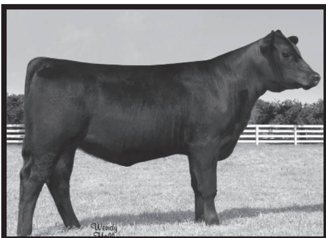
Vintage Rita 6098 - Dam of Lot 6 as a calf