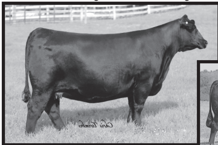
Chair Rock In Sure 2008 - Selling the right to flush this female