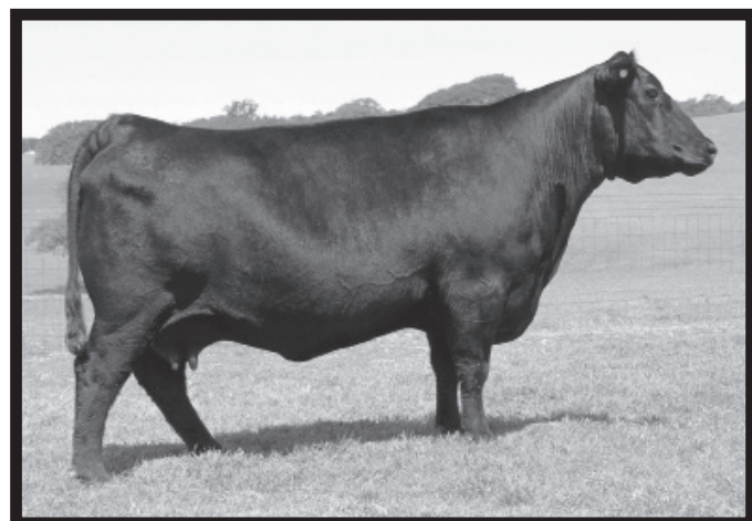
QHF Blackcap 6E2 of 4V16 4355 - Maternal grandam of Lot 11

•Here is a top shelf deal from the Rossens - A pick of 3 flush sisters after the DNA test for Genomics; Out of the $150,000 OA38 cow who is a flush sister to ABS's #1 sire Rampage, OA32, the $500,000 valued donor who sold to Spring Grove in Appomattox then sold to Highroller Angus of Center, Tx where she was the Lot 1 female of their first sale. •Other full sisters to the donor dam of these heifers include OA31- the $28,500 Lot 1 female of the 2016 Quaker Sale to Friendship Farm in Georgia and the $60,000 OA35 in residence at Vintage Angus Ranch and XL Ranch.