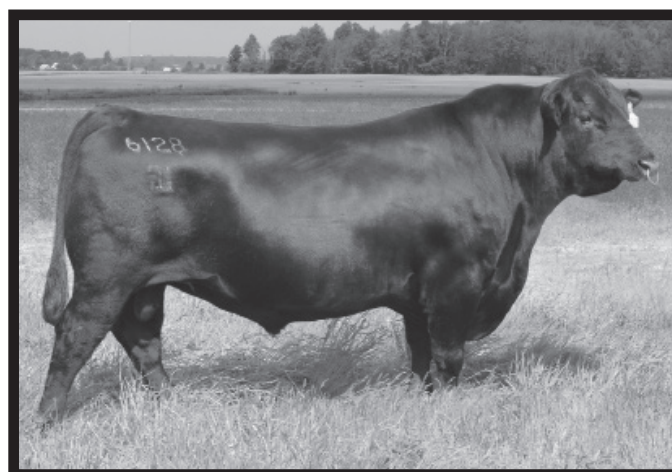
GAR Prophet -

• Has a 1/20/17 heifer calf, Lot 34A, by Deer Valley All In, tattoo 2957, BW 61 lbs.