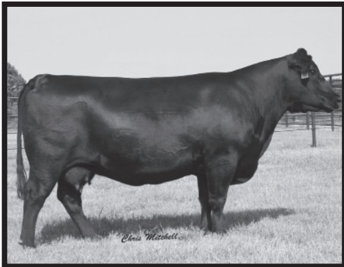
Deer Valley Rita 7856 - Dam of Lot 2B

• This proven dam and donor offers a unique package combining Gardens Prime Star genetics tracing back on the maternal side to the dam of the popular ABS stud E&B 1680 Precision 1023. Ranking 114% IMF and 124% REA in her U/S group, as well as strong HD50 testing, results in a top 1% MB and 4% RE EPD. Her progeny, both ET and natural, have been favorites of buyers and visitors alike.