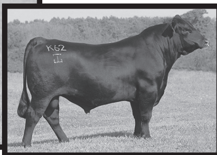
GAR Sure Fire - Full brother to the Lot 1A donor