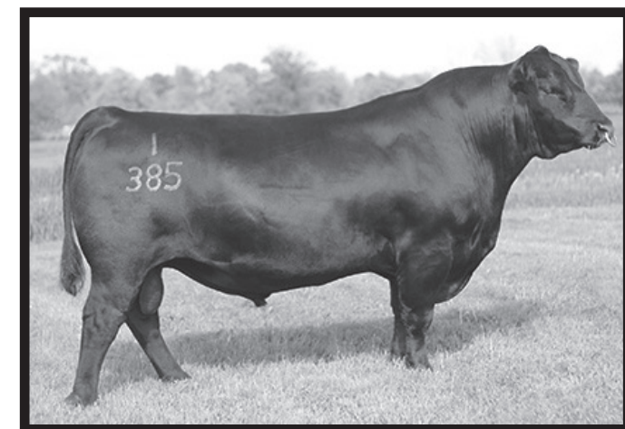
Connealy Comrade 1385 - Sire of Lots 63, 64, 66 and 67