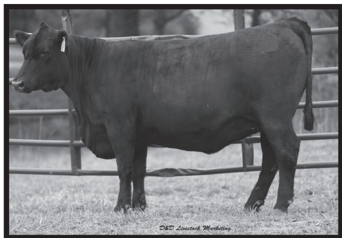
FASR Lucy 5107 - Lot 62