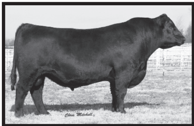
Plattemere Weight Up K360 - Sire of Lot 24

•A stout Bennett Fortress daughter out of the productive cow selling as Lot 24, here is a heifer that should be able to add to your bottom line.