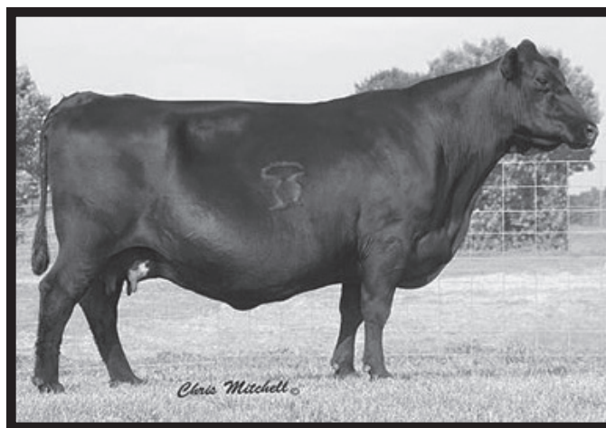
Basin Lucy 178E -

• Has a 1/22/17 bull calf, Lot 35A, by A&B Spotlight 3065, tattoo 2677 BW 71 lbs.