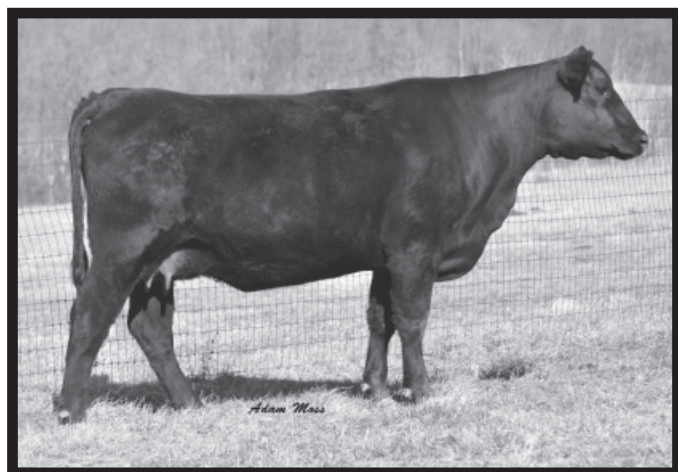
Thomas Blackcap 5349 -

•Lucy 5017 is a maternal sister to Woodside Lucy 6039 who also sales in this very deep offering