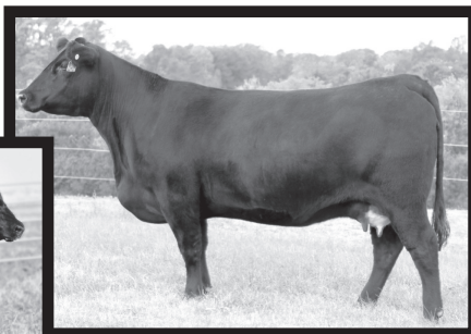
Welytok Knight Watchman 5C27 - Son of Lot 1B Donor