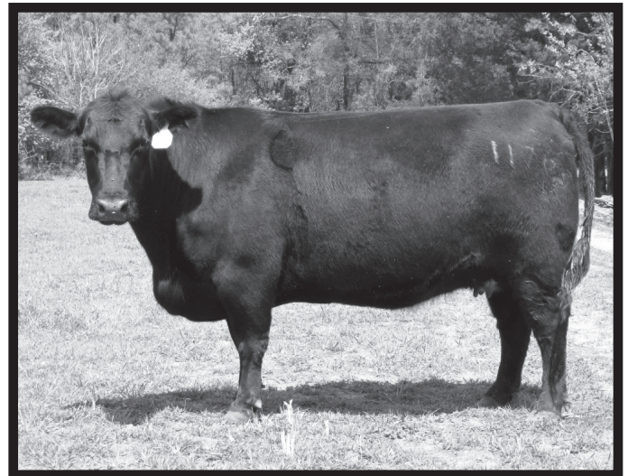
Springfield Lady 1176 - Lot 2A Donor

• Rita 4332's dam is a maternal sister to the popular Select Sires stud G A R Prophet, sired by Ambush 28, and served as a $35,000 valued donor at Kiamichi Link Ranch as well as to sibs serving as donors in the Boyd Beef, Deer Valley, Maplecrest, and Big Timber programs. Embryos representing full sibs in blood to KLR Rita 4332 were the Lot 2B offering at the 2014 Trowbridge Family of Friends Sale at the National Western Stock Show, selling in excess of $1000 each.