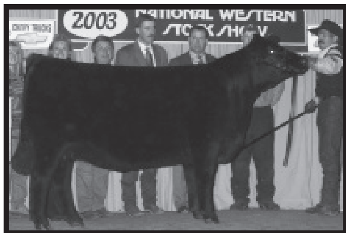
Greens Princess 1012 - Lot 43 stems from this great female