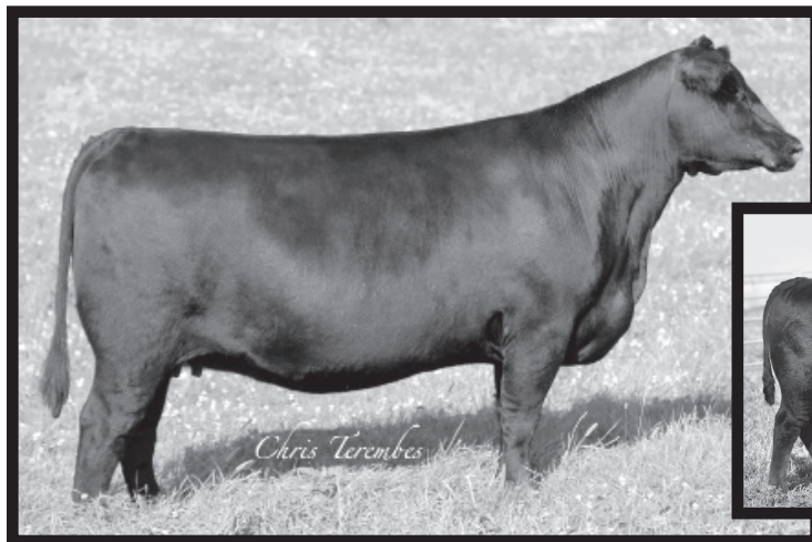
Welytok Total 10 Erianna 3B2 - Full Sister to Lot 1B