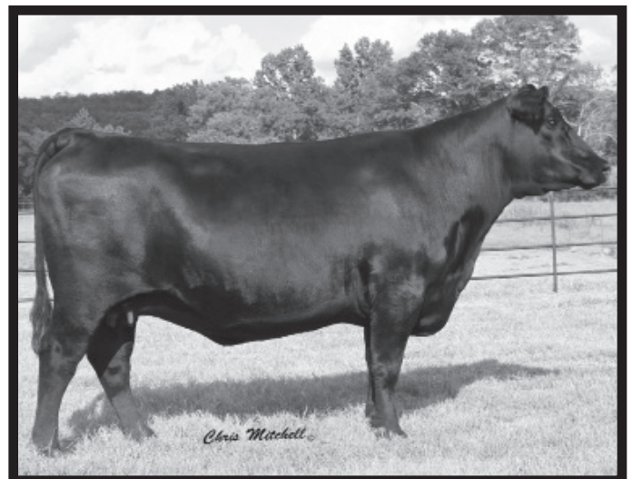
GAR 28 Ambush 1749 - Dam of Lot 2C

• This Rita family cow is an excellent EXAR Denver daughter out of Deer Valley Rita 7856, who is herself a daughter of the great G A R Ext 614 having had well over $4 Million in progeny sales. KLR Denver 4629's October 2016 bull calf by WR Journey-1X74 is an absolute knockout, with 15 EPD's in the top 20% of the breed including a top 1% Milk, 2% RE, 4% $B, top 10% $W, $G, $YG, DMI, CEM and MH.