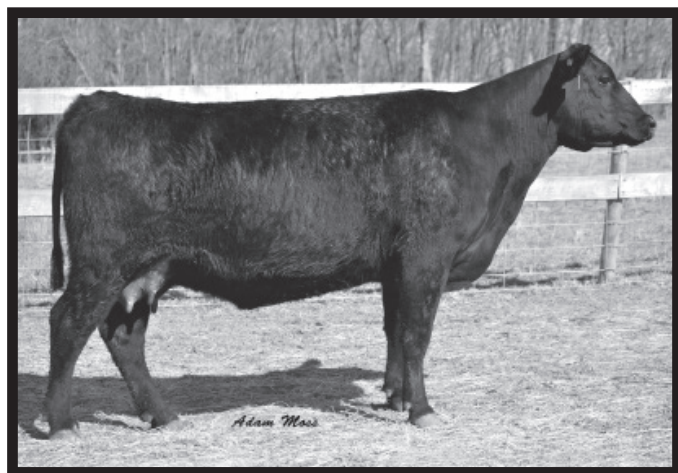
Audley Blackcap z116 - Lot 28