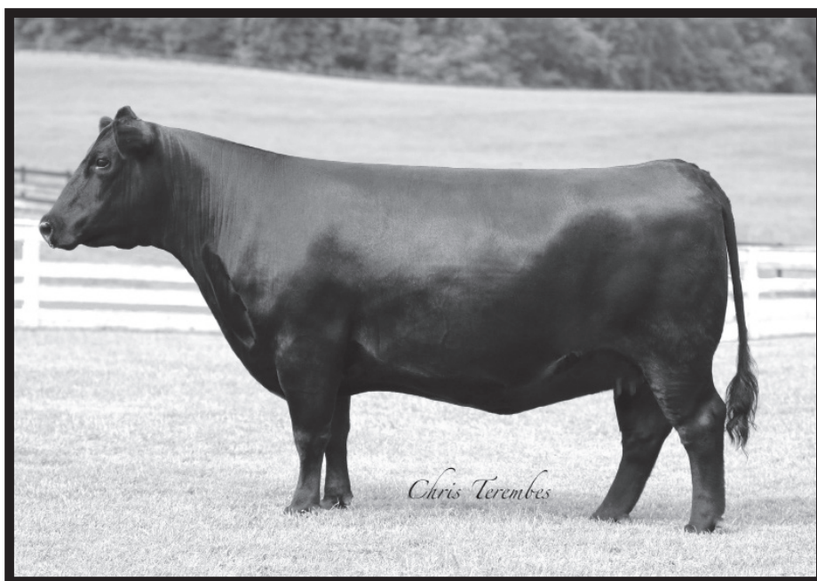
Quaker Hill Blackcap 0A32 - A full sister to the donor dam of Lots 10A-C