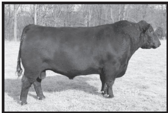
MCATL Reachout 836 - Sire of Lot 45