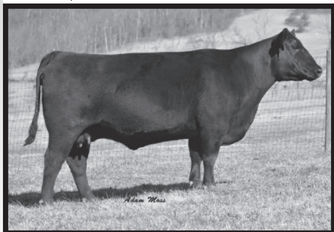
Rita 2P1 of 0210 7R3 - Lot 53