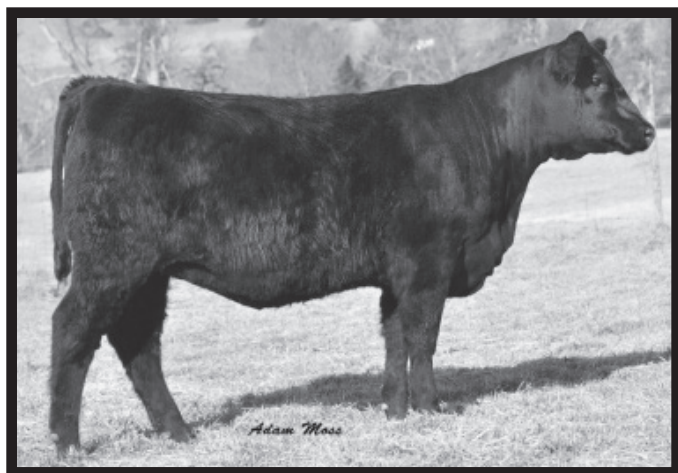
Woodside Blackcap 6036 of 1746 - Lot 17