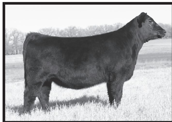
EF Rita 4058 - Donor Dam of Lot 77 as a calf