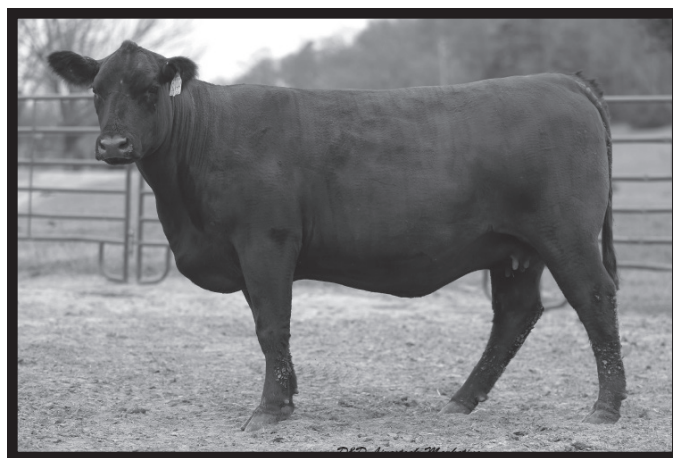
Visions 0100 Uppity 412 - Lot 38