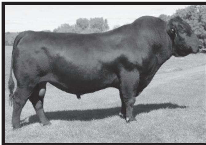
Quaker Hill Rampage 0A36 - Service Sire of Lot 59