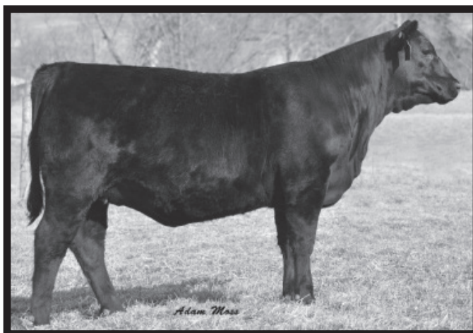
Woodside Blackcap 6036 - Lot 16