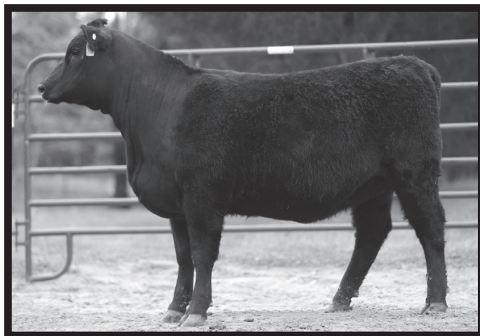
Fasr Rita 6001 -