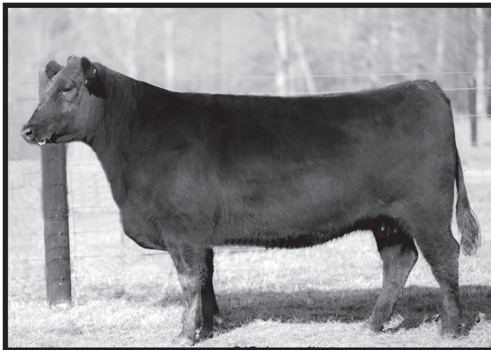
Edgewood 267 of 0T13 GameOn - This Donor Sells!