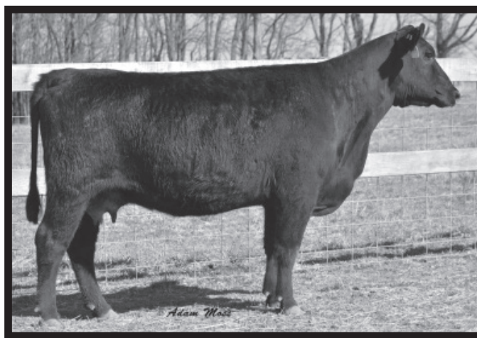
Audley Frontman z93 - Lot 29