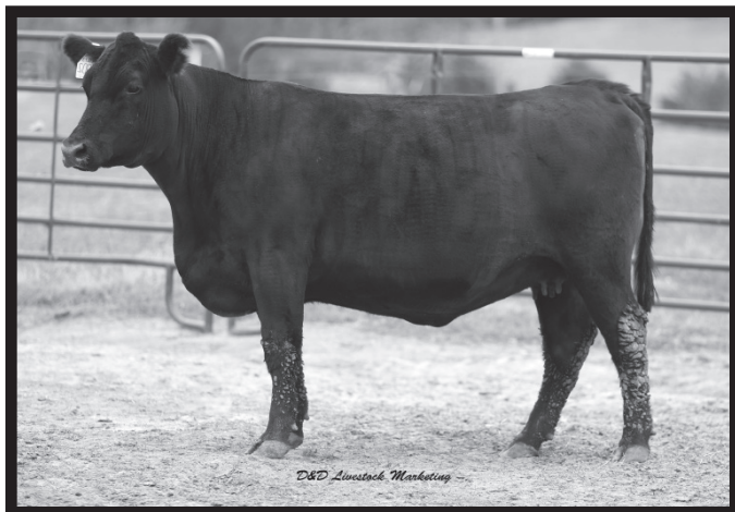
Fasr Eriskay 5002 - Lot 38