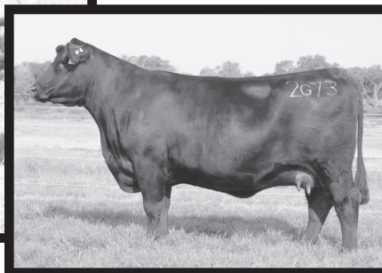
Wild Wind Blackcap Lady 2G73 - Dam of Lot 3 donor