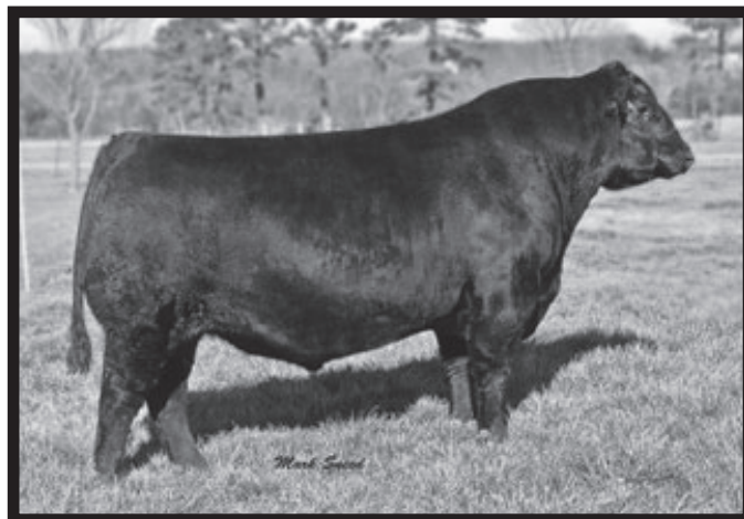
Bruin Upoar 0070 - Sire of Lot 25A

•This Bruin Upoar 0070 daughter offers a balanced set of EPDs and a pedigree backed by proven genetics.