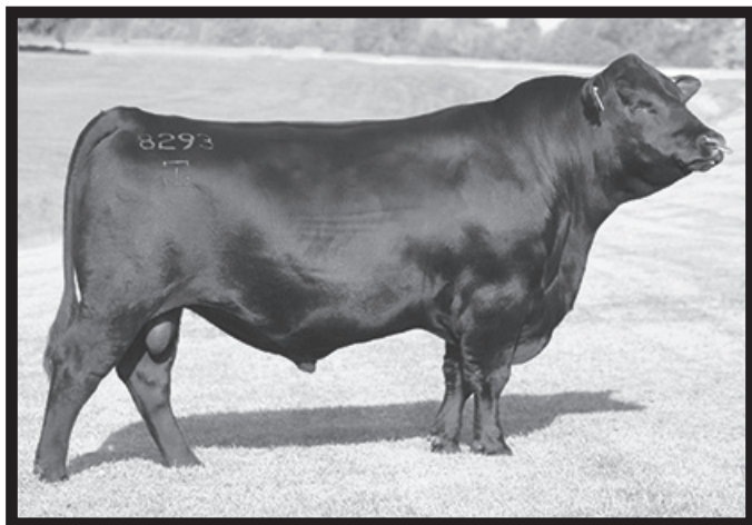
GAR Prophecy - Sire of Lot 32A