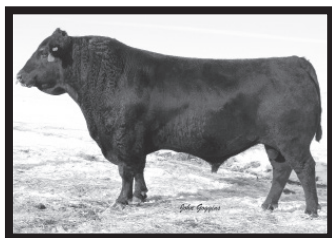
KCF Bennett Consent Y75

Edgewood Lady 968 - Selling choice of two heifer pregnancies out of this donor