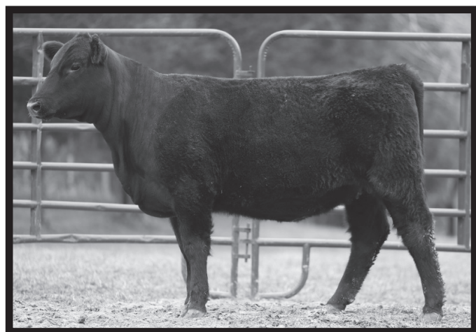
Fasr Beauty 6002 - Lot 70