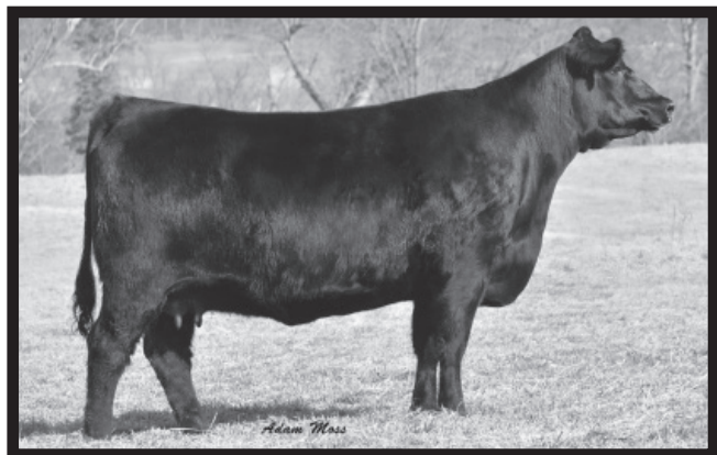
Ma 4Q8 of Gar 3371 - Lot 37