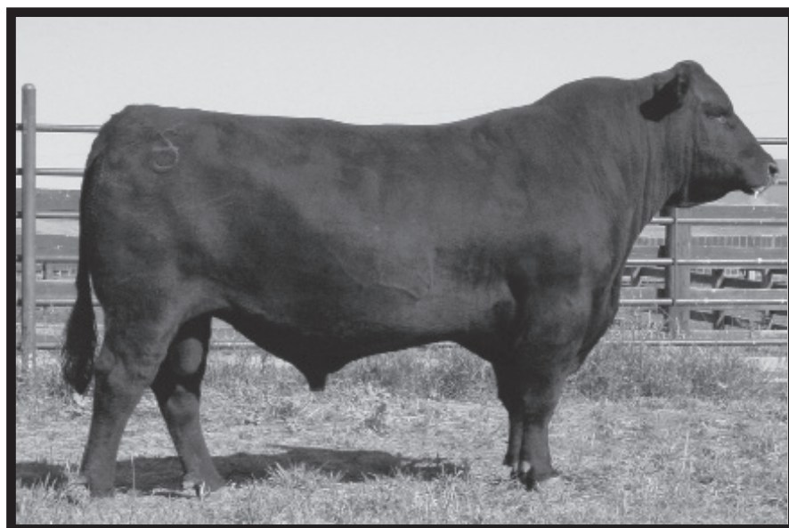
A A R Ten X 7008 SA - Sire of Lot 18 and 19A