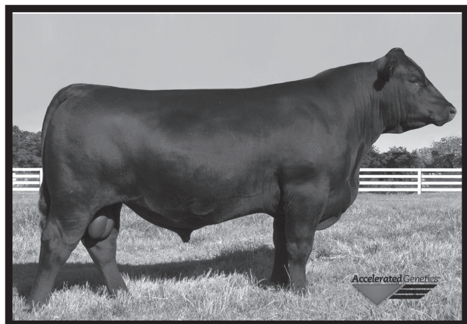
VAR Discovery 2240 - Sire of Lot 3A