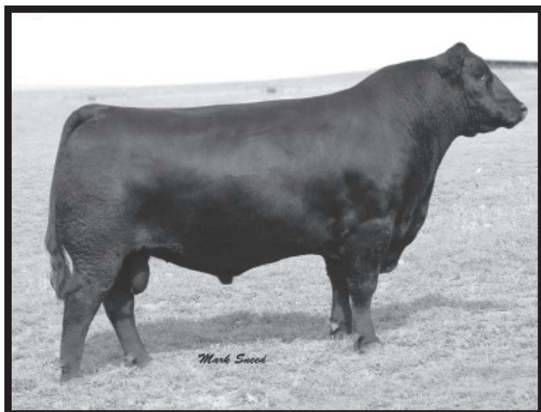
Hoover Dam - Sire of Lot 26