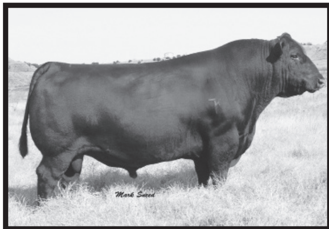
Kessler's Frontman - Service Sire of Lot 31