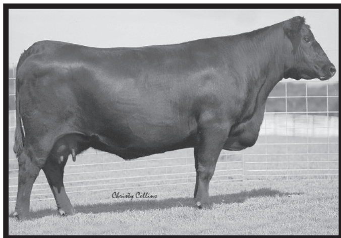
MF OSC3 Queen B 8EX5 -

Lot 68 stems from this foundation female