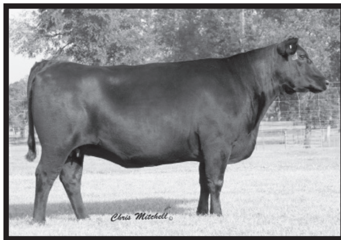
Quaker Hill Queen 1L4 - Maternal grandam of Lot 55

•Sells with a bull calf born 1/4/17 by Quaker Hill Waylon 3W4.