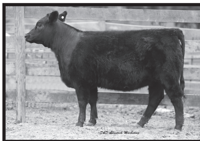
Fasr Lass 6006 - Lot 71